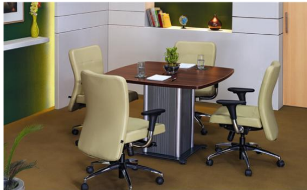
Talk 4 Seater Square